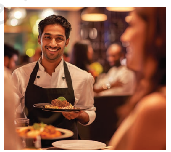
Services at restaurant